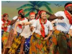
Students Perform West African Drumming, Dance at End-of-Year Concert