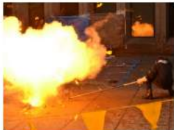
Students Toss Objects from Exley's Roof during Big Drop