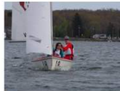
Wes Sailing Team Hosts First Inter-Collegiate Regatta