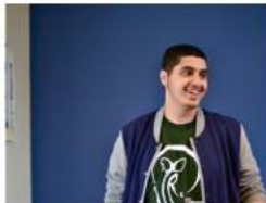
Refugees' Art Featured at Student-Run "Art in Crisis" Exhibit