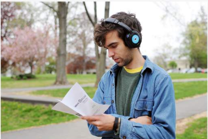
During the "Wes Out-Loud" performance, audience members wore wireless headsets to listen to recorded stories of place created for various sites on campus.

The Theater Department presented "Wes Out-Loud: Stories of Place" April 28 on campus.